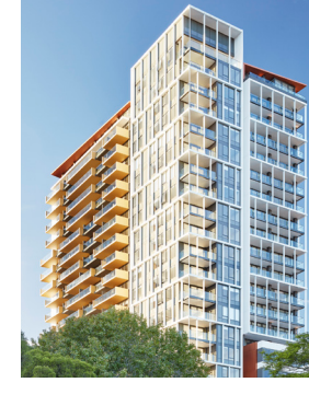
One Twenty Macquarie, Macquarie Park