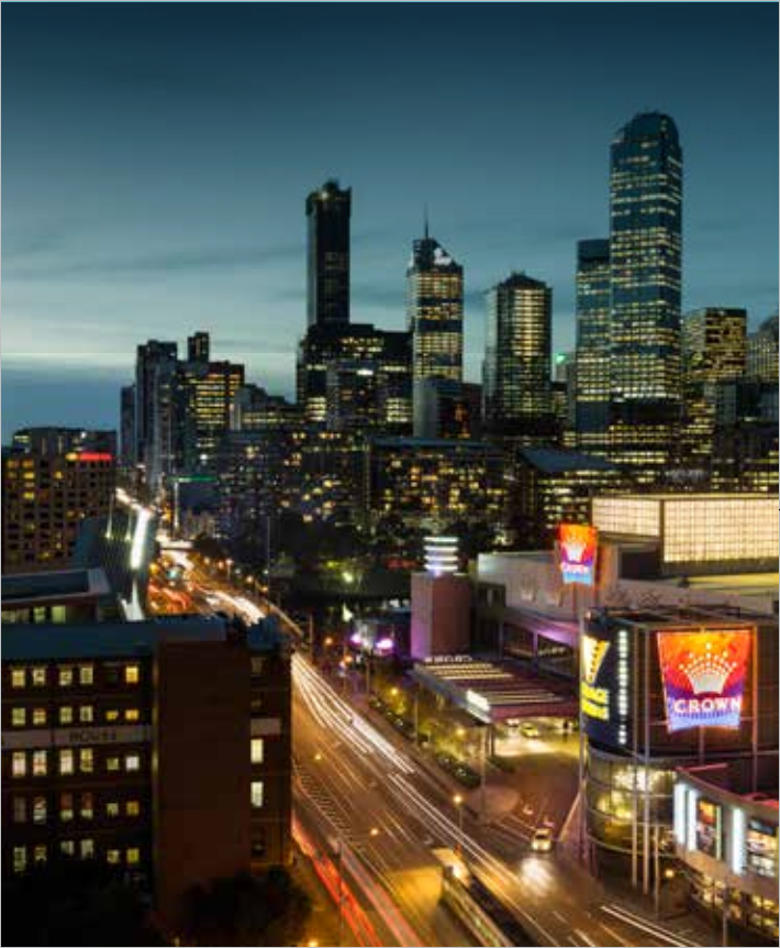
1KM > CROWN CASINO

This spectacular stadium is the only Southern Hemisphere football stadium with a completely retractable roof. From Australian Rules Football to soccer, speedway, rugby, cricket and internationally-renowned musical superstars – you can see it all, rain or shine.