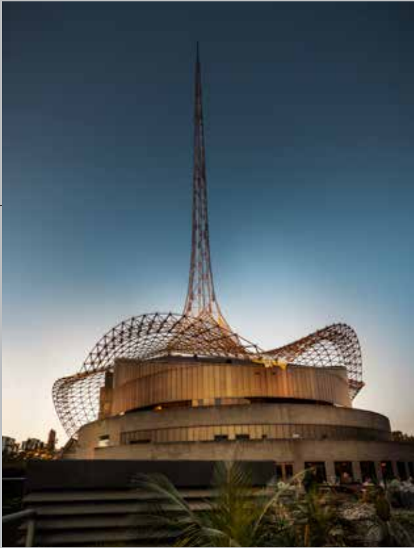
900M > MELBOURNE FASHION

Melbourne’s creative community is diverse and expressive. The Arts Centre precinct puts the best of international artistic expression at your fingertips, with opera, dance, music, visual art and performance.