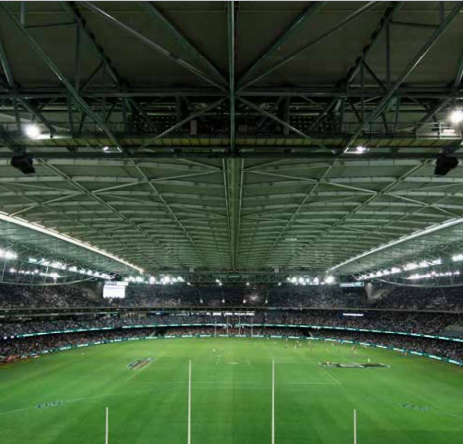
800M > ETIHAD SPORTS STADIUM

Premier Tower is set to become one of Melbourne’s most sought-after residential addresses – complete with city convenience, luxurious comfort and cutting-edge style.