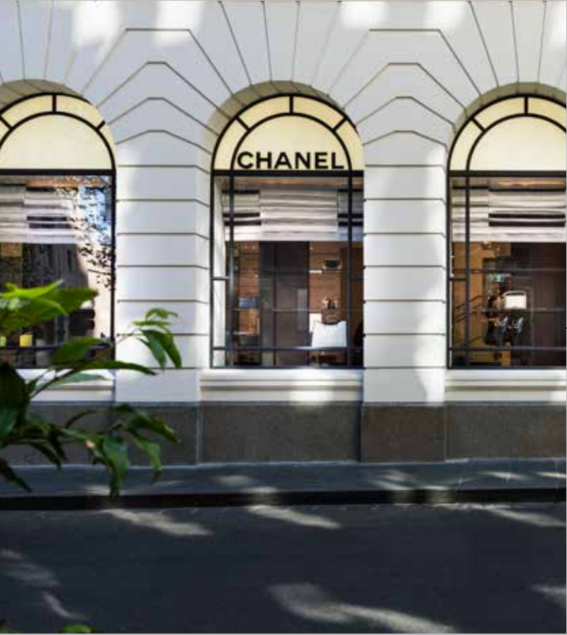
1.3KM > EMPORIUM

The Crown complex is home to the best in prestige retail, with the world’s most impressive celebrity entertainers, gaming, luxury hotel accommodation and Australia’s best restaurants – all under one sprawling roof. Easy access to this globally-recognised hub is one more bonus of your Premier Tower address.