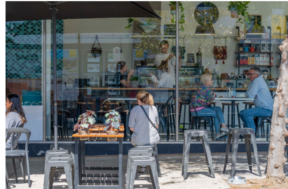
Uncles Moorabbin 270m*

A community well and truly in demand, there's not a dull moment in Moorabbin.