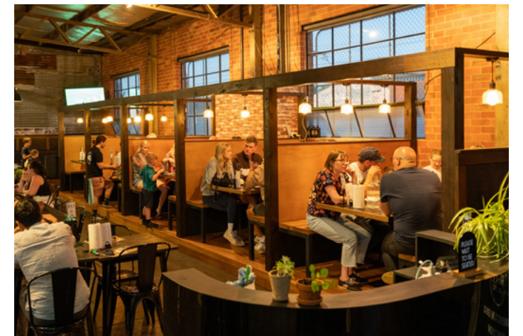
Comma Food & Wine 400m*

A stone's throw from your front door, gourmards can delve into a mix of globally inspired restaurants, cafes and watering holes. Start the day at Uncles Moorabbin and end it at Comma Food & Wine or Stomping Ground and the thriving Morris Moore precinct. Supermarkets and the shopping mecca of Westfield Southland cater to your everyday essentials. From Moorabbin Station it's a seamless 30-minute journey to the CBD, while the sheltered waters of Hampton Beach is just 10 minutes' down the road.