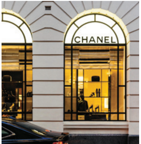
MELBOURNE FASHION BOUTIQUES

Melbourne Square sits on the doorstep of Australia’s most significant sporting hub with world leading sporting facilities such as The MCG, Melbourne and Olympic Parks & AAMI Park.