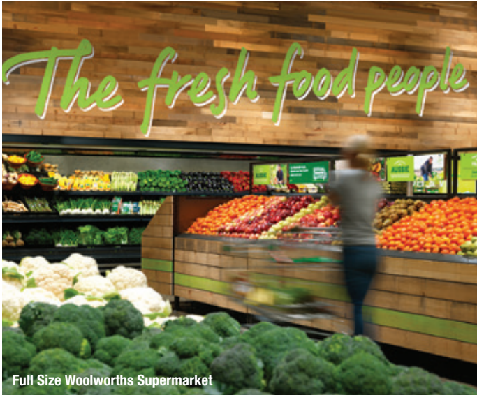
Full Size Woolworths Supermarket