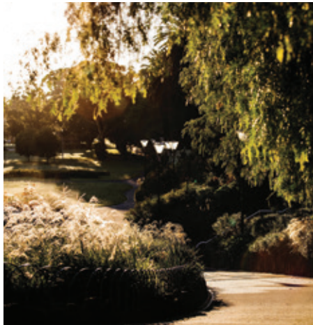
ROYAL BOTANIC GARDENS

All of Melbourne’s celebrated lifestyle options are at Southbank, a place now considered to be a true international destination.