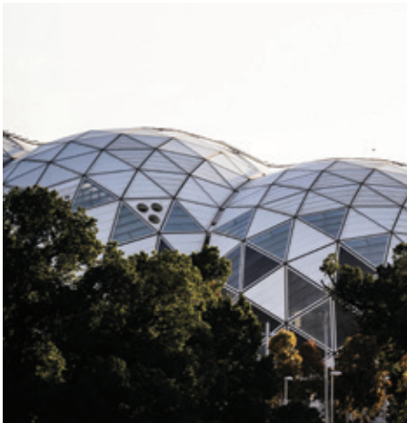
MELBOURNE SPORTING PRECINCT

Melbourne’s best loved expanse of tranquil and carefully maintained parklands is close by, connecting the Royal Botanic Gardens with Kings Domain and Alexandra Gardens.