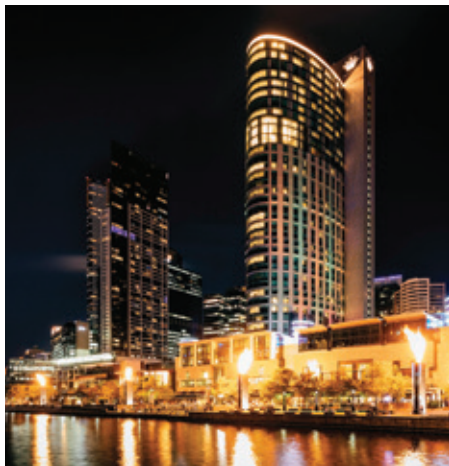
CROWN CASINO ENTERTAINMENT COMPLEX

Living at Melbourne Square means shopping at some of the city’s most iconic destinations, from the bustling South Melbourne Market to Crown and the Paris end of Collins Street.