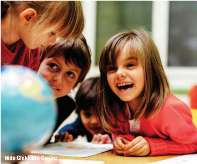
Nido Childcare Centre

Merging urban precinct with traditional neighbourhood values every convenience is available literally on your doorstep. Whether you are hosting a dinner party or in need of a quick bite after a late night at the office, Melbourne Square provides a range of opportunities. Onsite childcare facilities are also available for residents to utilise with Nido Childcare now located on the ground floor.