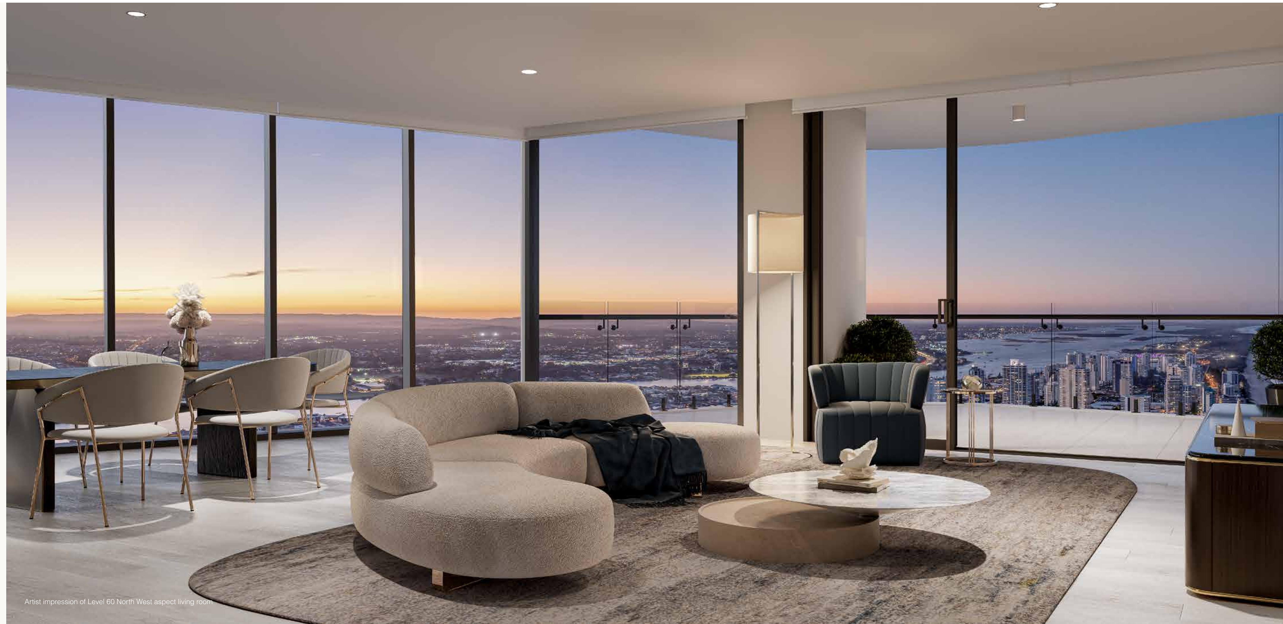
Artist impression of Level 60 North West aspect living room