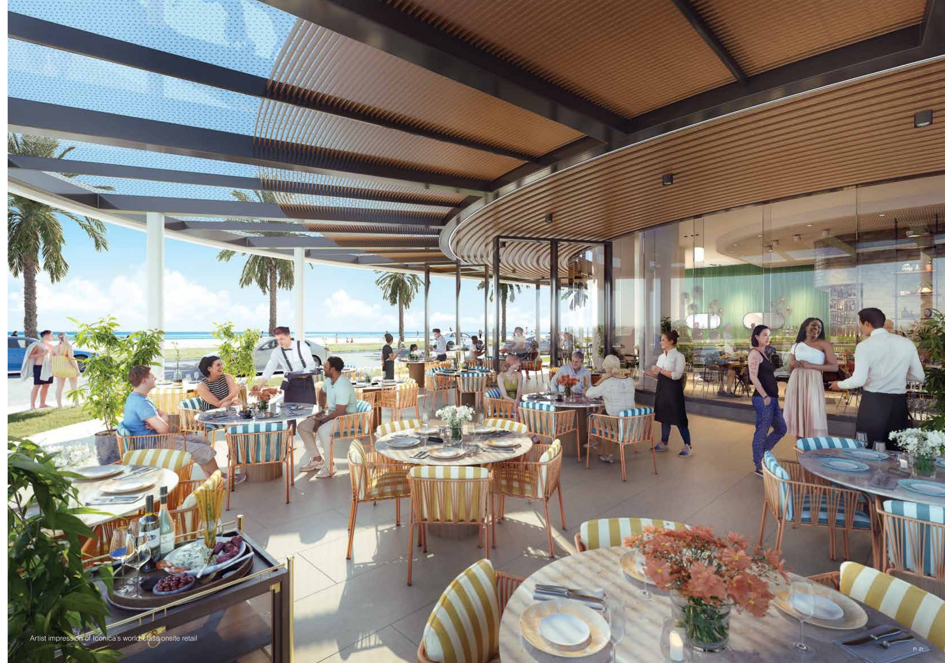
Artist impression of Iconica's world-class onsite retail