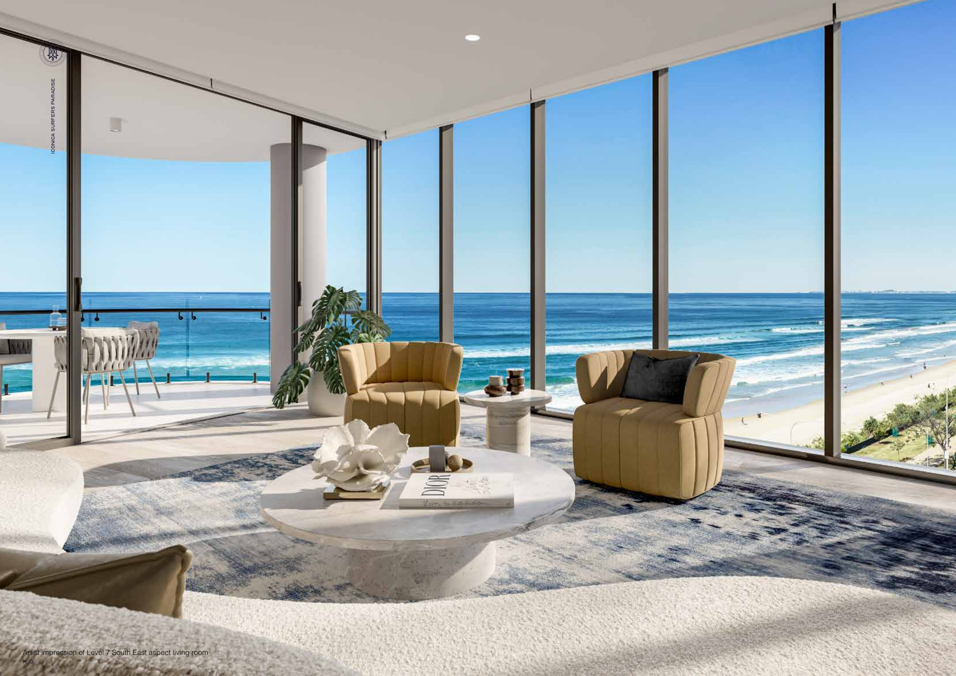
Artist impression of Level 7 South East aspect living room P. 10