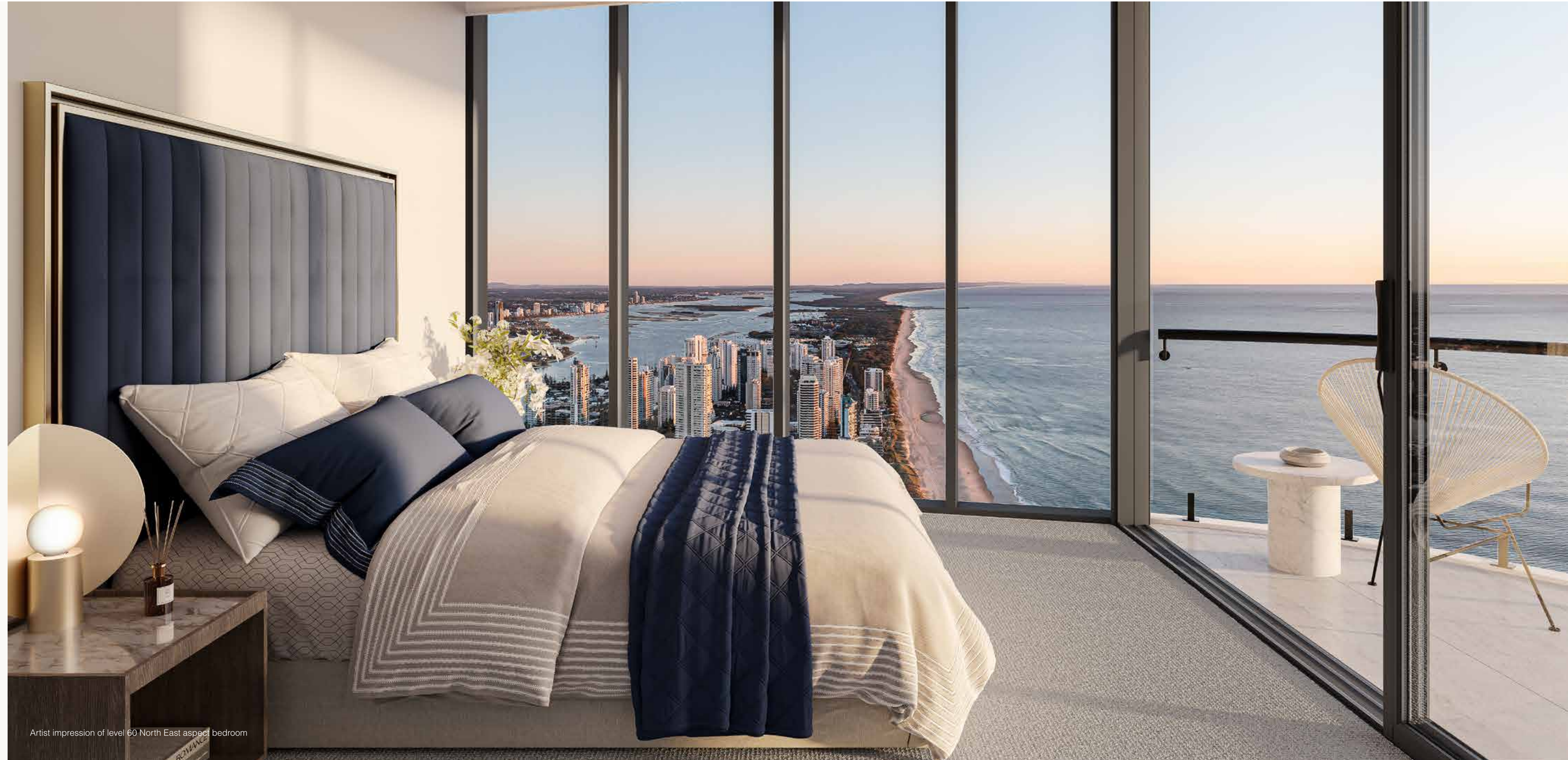
Artist impression of level 60 North East aspect bedroom

The spacious bedrooms have been designed as sumptuous sanctuaries where you can wake up to the sight and sound of the ocean, with floor-to-ceiling windows harnessing incredible views. Sophisticated ensuites grace the master bedrooms while generous built-in wardrobes ensure ample storage space.