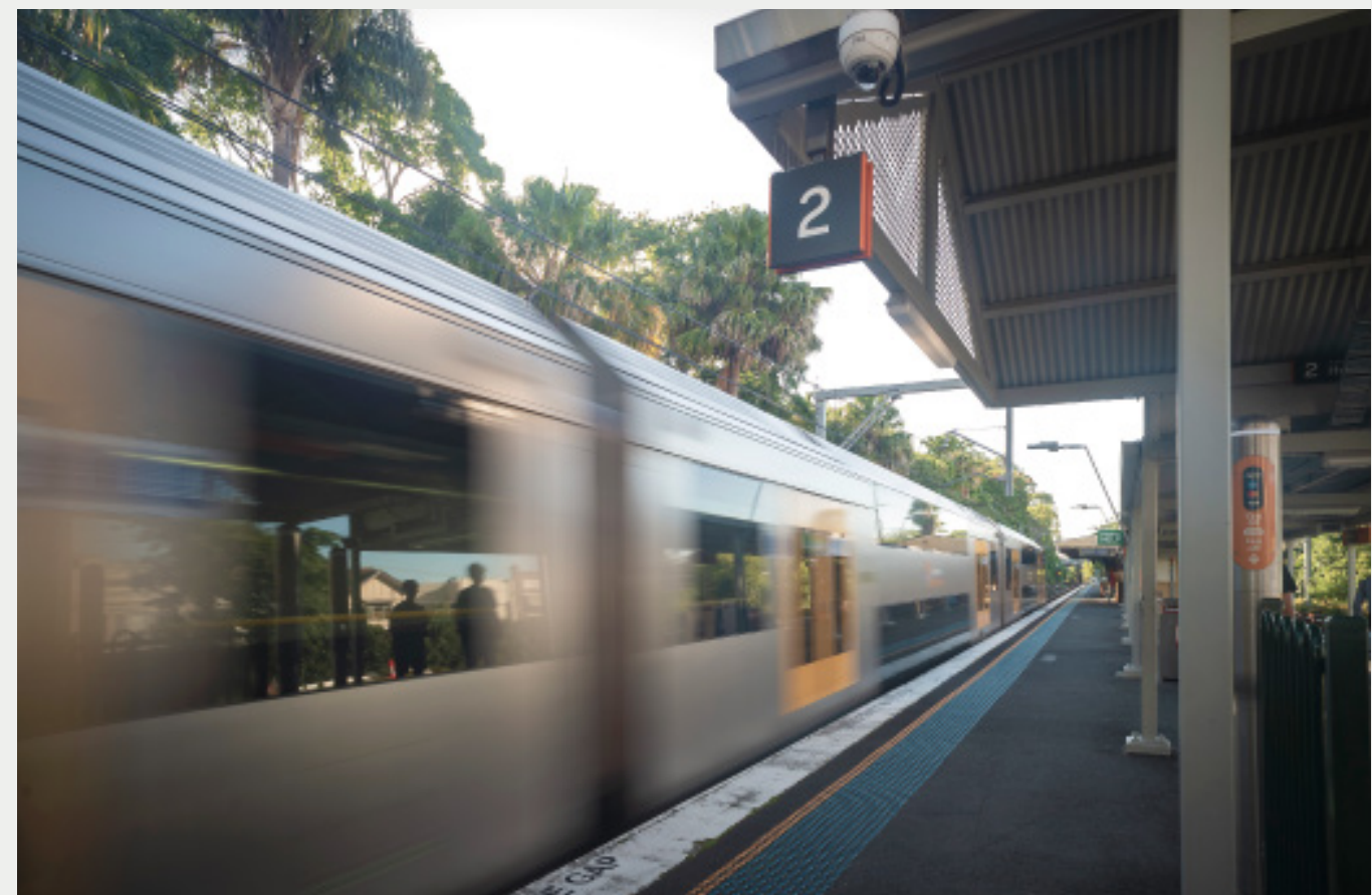
GREENVIEW, LINDFIELD AT THE CENTRE OF SYDNEY'S BEST LIFESTYLE.