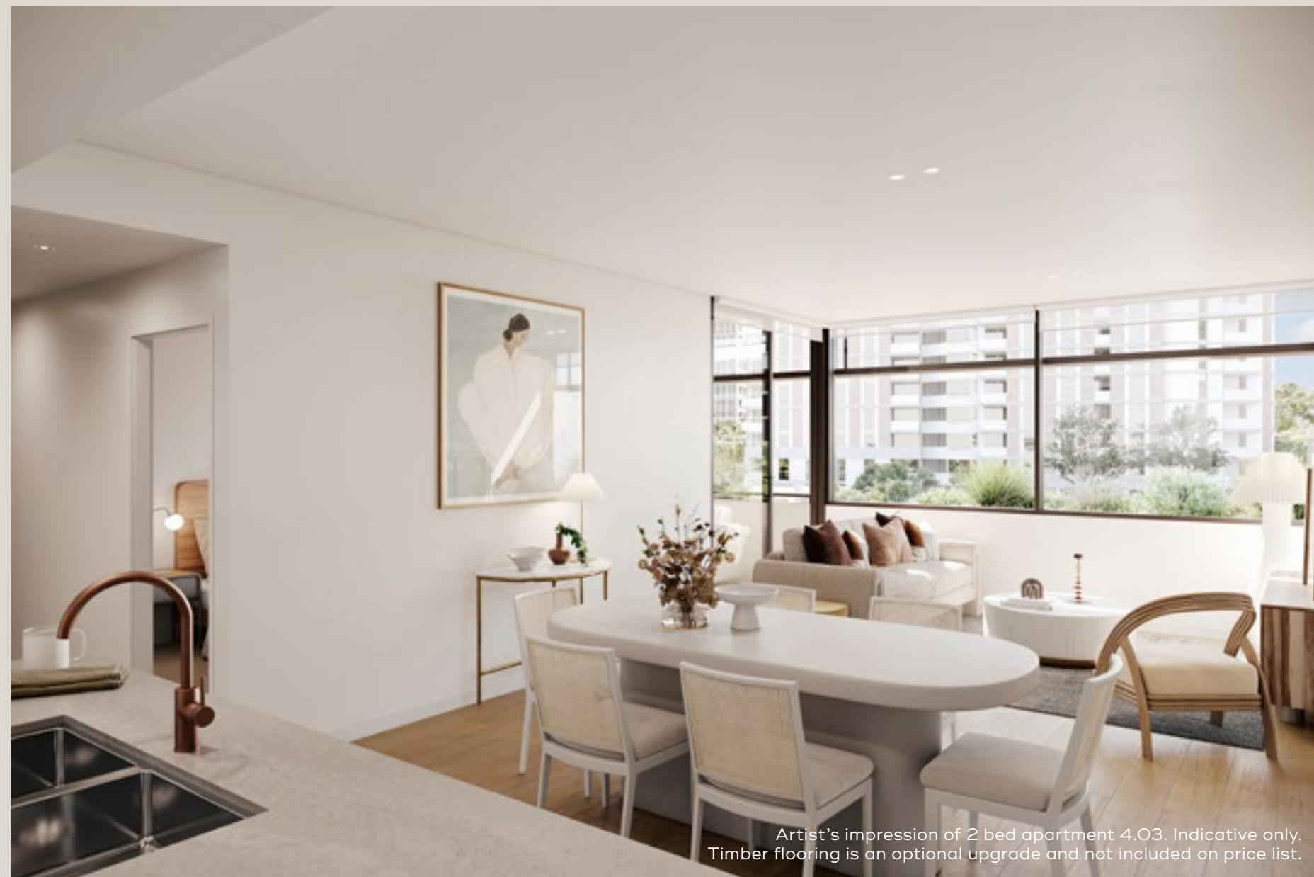
Artist's impression of 2 bed apartment 4.O3. Indicative only. Timber flooring is an optional upgrade and not included on price list.

Enjoy spaces that invite light and greenery into the heart of your home. From stylish studios to penthouse apartments, careful planning delivers a generous flow of space for seamless living. Open and ambient, they set the stage for relaxed village life.