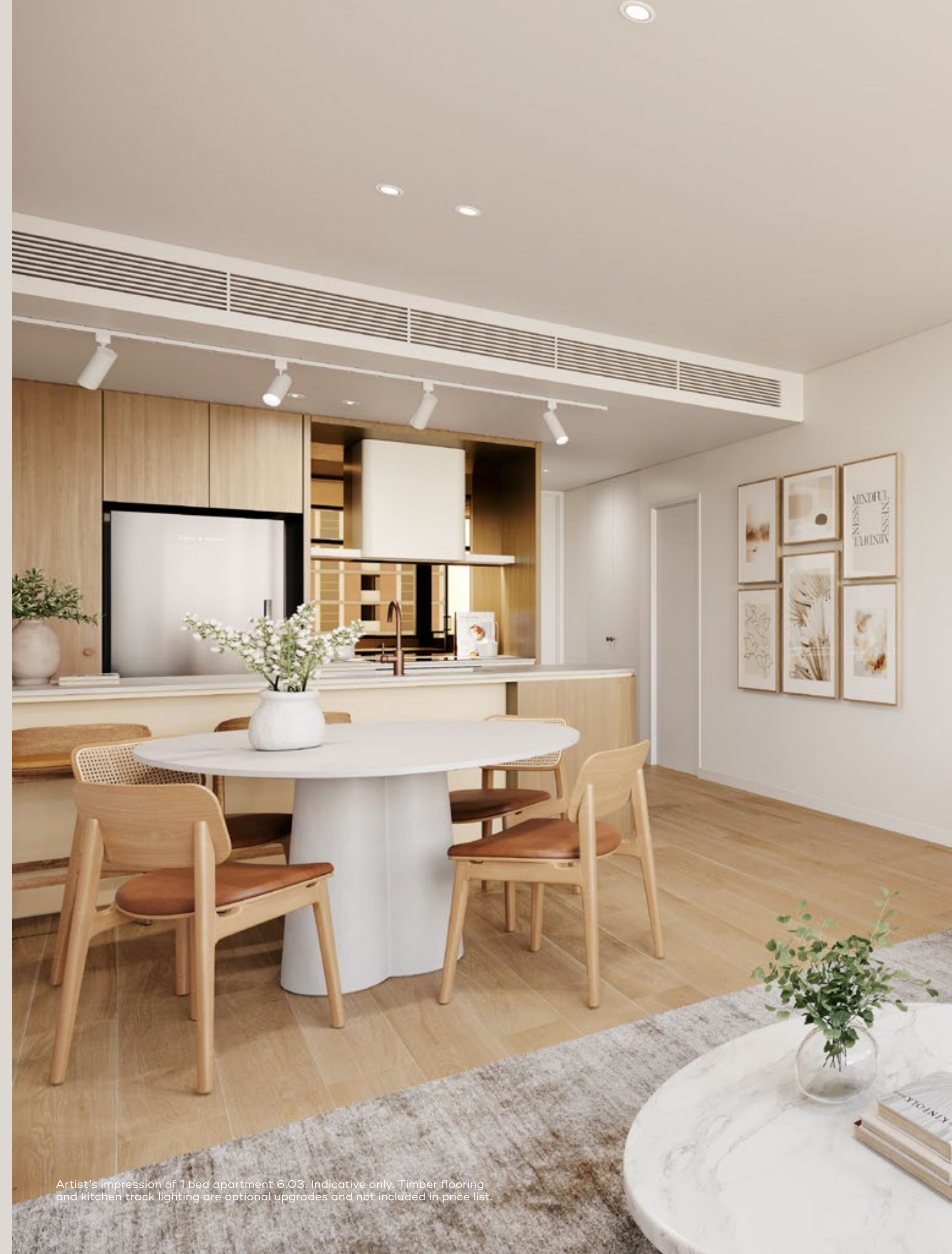
Artist's impression of 1 bed apartment 6.O3. Indicative only. Timber flooring and kitchen track lighting are optional upgrades and not included in price list.