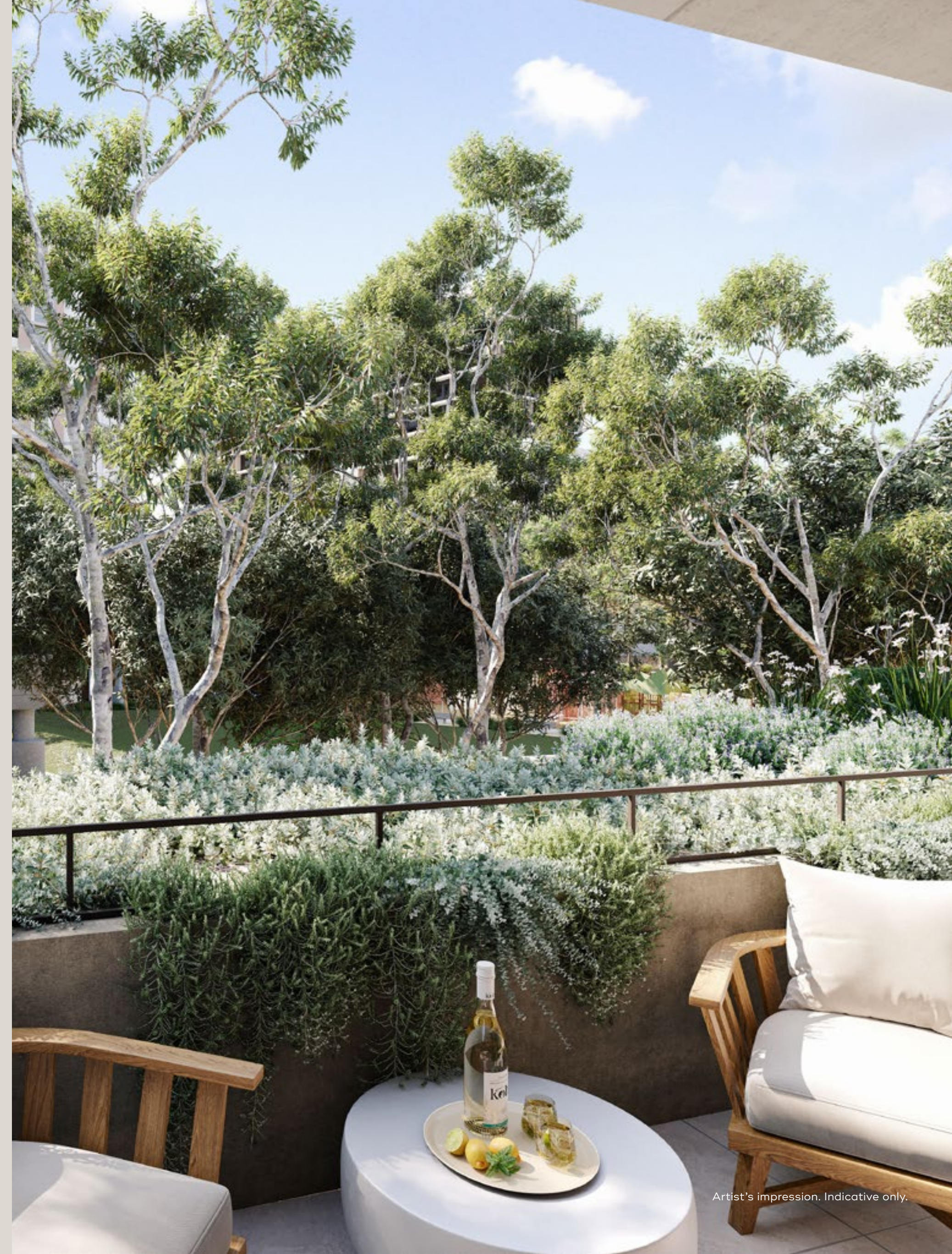
Artist's impression. Indicative only.