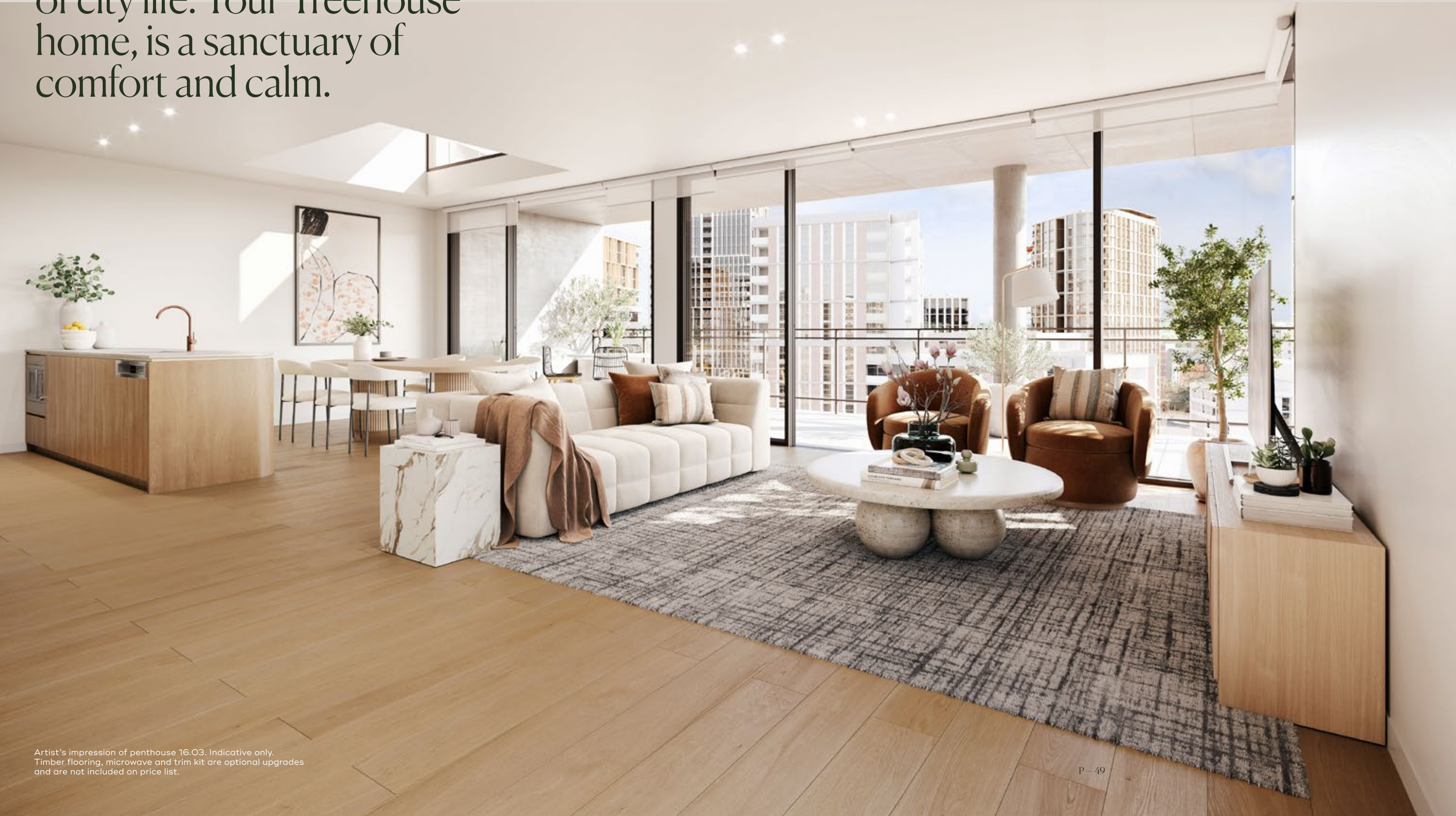
Artist's impression of penthouse 16.03. Indicative only. Timber flooring, microwave and trim kit are optional upgrades and are not included on price list.

Escape the fast pace of city life. Your Treehouse home, is a sanctuary of comfort and calm.