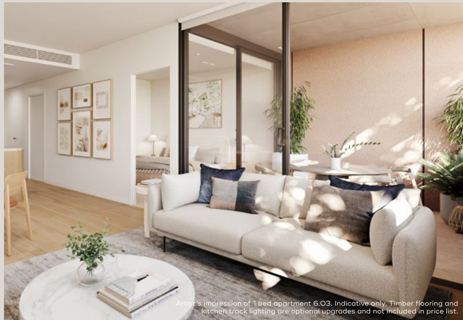
Artist's impression of 1 bed apartment 6.03. Indicative only. Timber flooring and kitchen track lighting are optional upgrades and not included in price list.

You'll love the atmospheric inside-out living environments, perfect to enjoy breakfast as birdlife flits through the spreading trees. Living areas spill to beautiful balconies, drawing in summer breezes and encouraging everyone out to enjoy the sun.