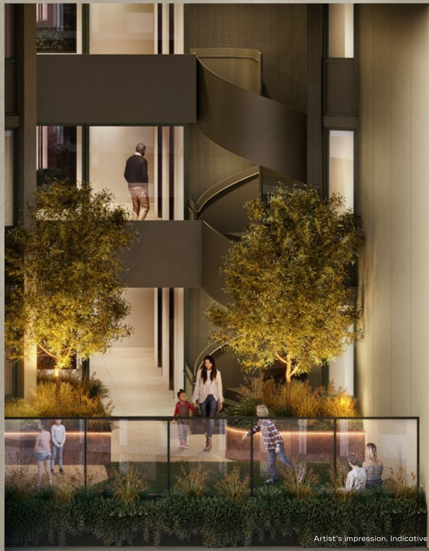
Artist's impression. Indicative only.

Work-life Balance Collaboration Spaces Outdoor Cinema Rooftop Indoor Kitchen Contemplation Spaces Health & Wellness Natural & Playful Climbing Wall Waterplay Grass Area Trees & Plants Seating Nooks Park Views