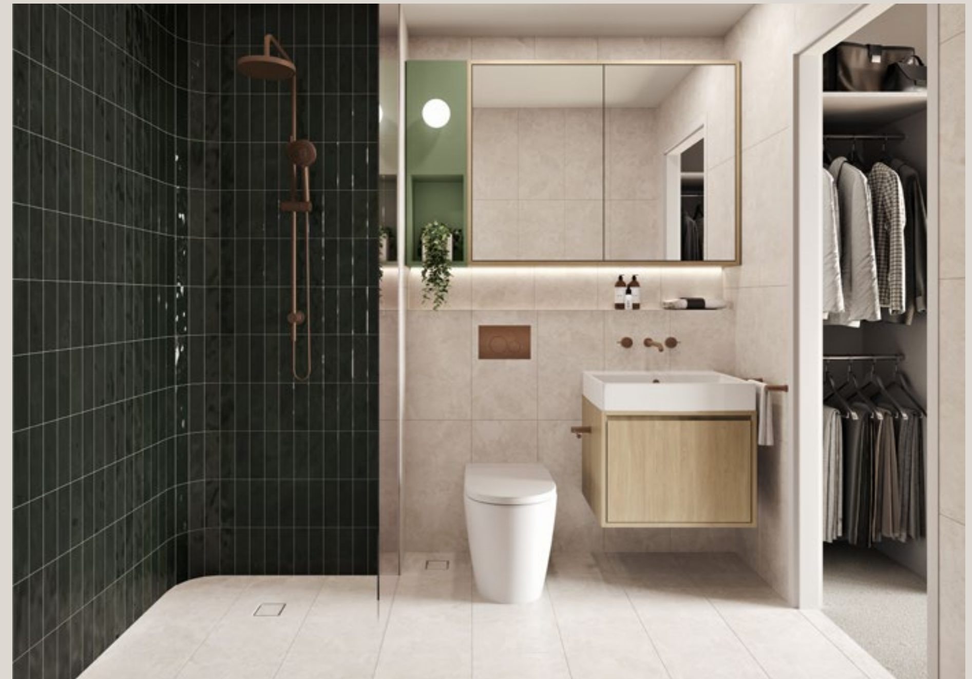
Artist's impressions. Indicative only. Location of floor wastes subject to move pending final construction coordination. Fourth wall has full height tiling. The wardrobe shown is an optional upgrade and is not included in price list.