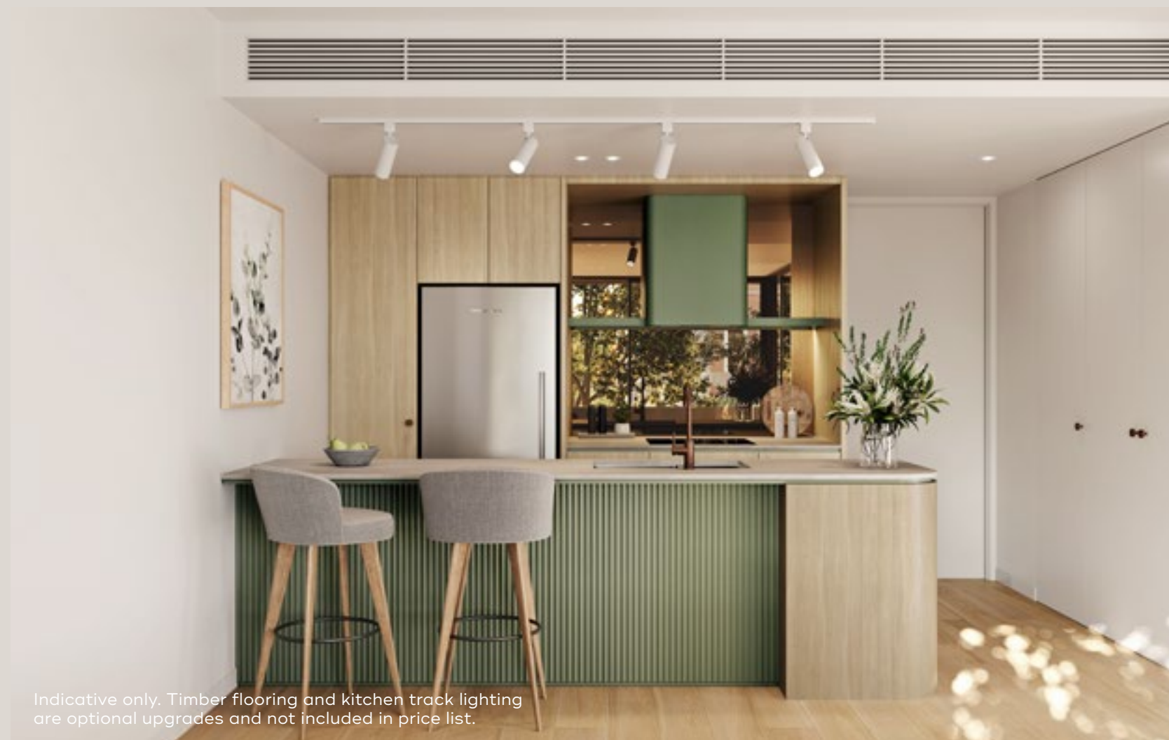
Indicative only. Timber flooring and kitchen track lighting are optional upgrades and not included in price list.

Clever design of the kitchen caters to both daily life and entertaining with ease – an inviting space to relax with family or share with guests. The natural palette in soft greens, greys, warm timber and mirrored bronze brings a welcoming sense of home.