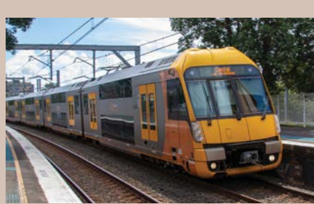
Werrington train station

Penrith train station is a short drive or bus ride from Jordan Springs. There's also a regular bus service that connects residents with the train station and city centre.