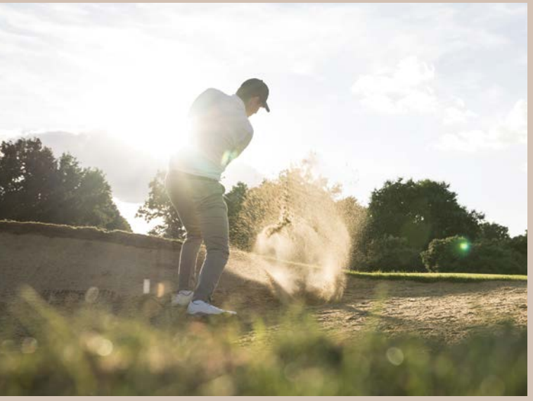
Dunheved Golf Club