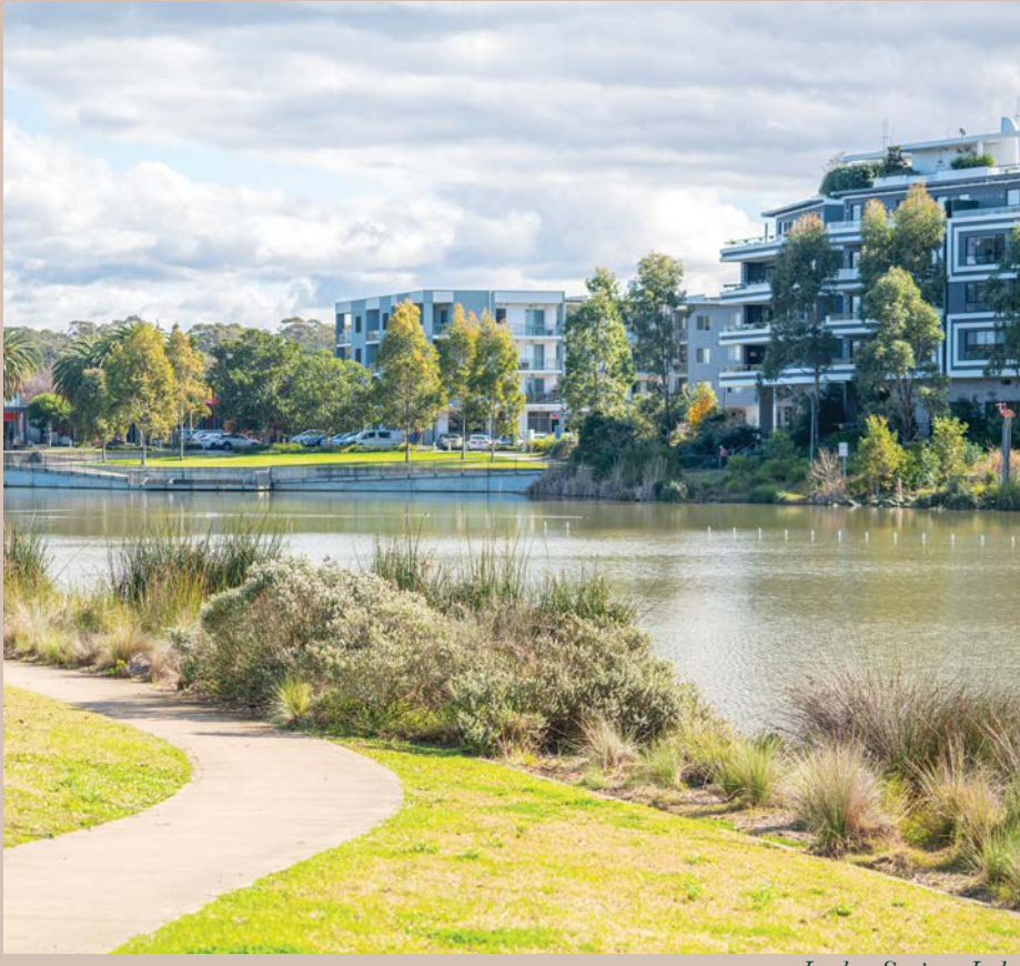
Jordan Springs Lake

A distinctive pocket of Sydney, Jordan Springs is home to expansive green spaces and a man-made lake, giving residents a sense of tranquility and calm.