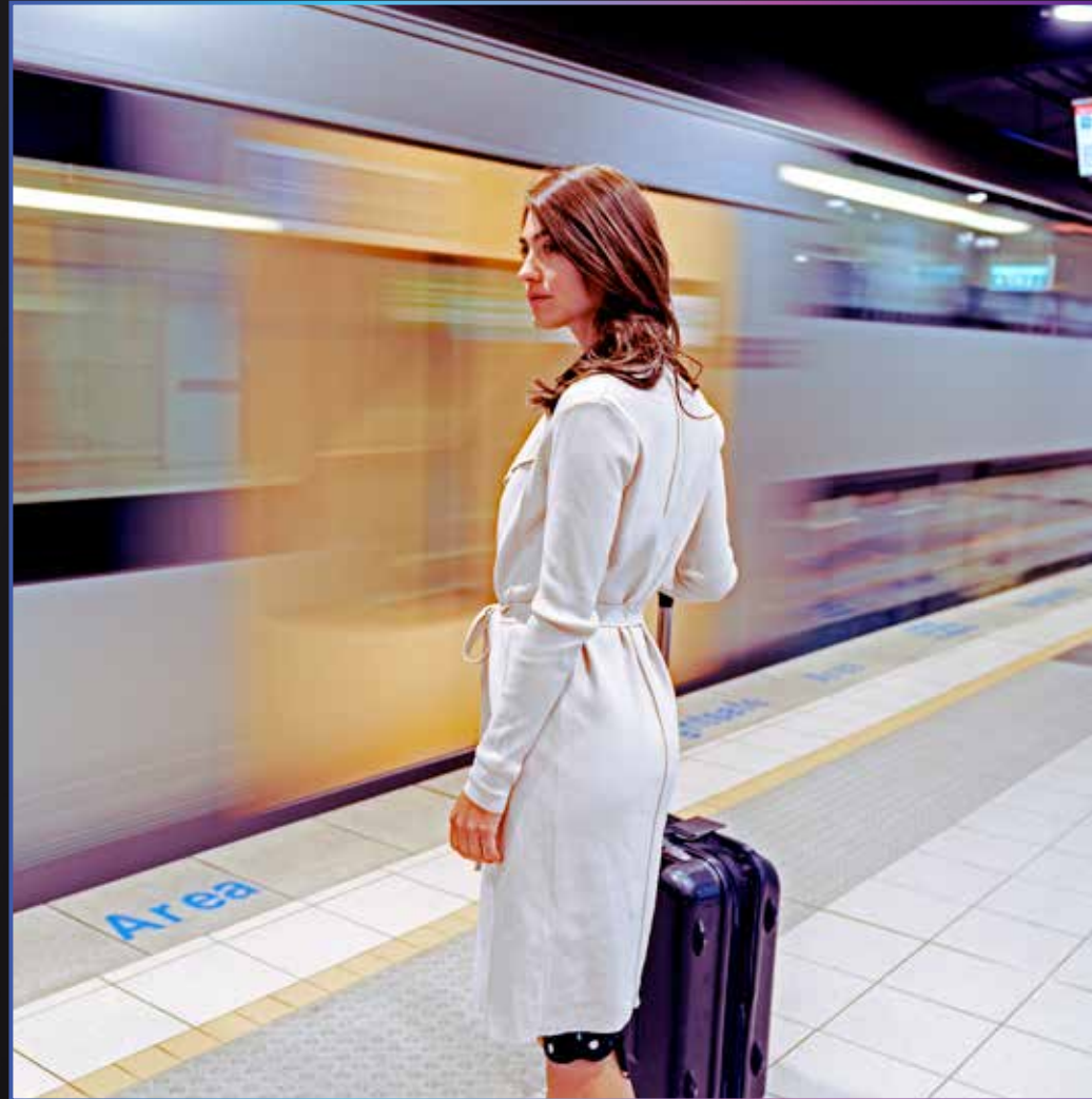
Green Square Station

Whether it's shopping, dining, exercise or entertainment, at Downtown a vital and eclectic lifestyle surrounds you. Pick up your morning coffee from local haunts such as Allpress or Haven Specialty Coffee. Meander streets lined with cafes, artisan stores and weekend markets, punctuated with glorious greenery and cycleways. Zetland's boulevards offer up plenty of surprise.