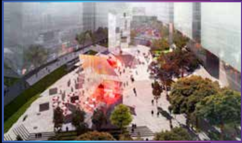
The Library and Plaza looking east towards Zetland Avenue