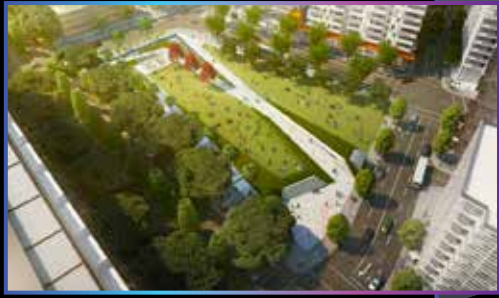
The Drying Green Park looking south east towards the Former Royal South Sydney Hospital Site.