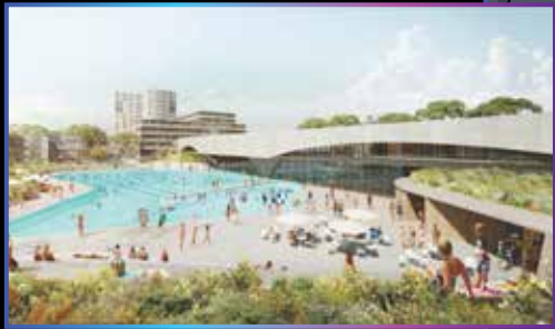
Gunyama Park and Green Square Aquatic Centre looking south