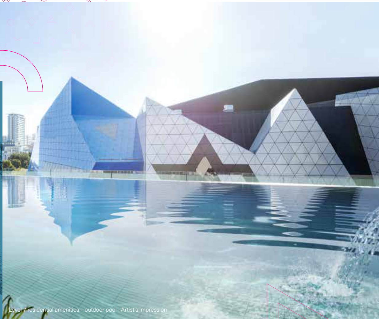
Level 7 residential amenities – outdoor pool - Artist's impression

Apartment residents look out from an infinity pool deck on the sky-garden level, across to the captivating architecture of the RAC Arena. Or marvel at the Perth city skyline. And from another vantage point, gaze over the bustling and lively Milligan Steps plaza area below.