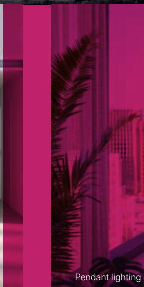
Pendant lighting and shelving unit not included