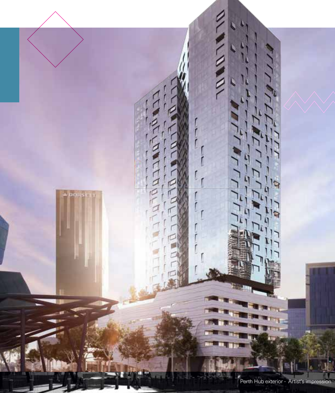
Perth Hub exterior - Artist's impression