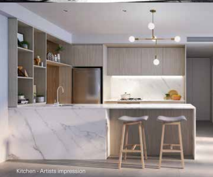
Kitchen - Artists impression