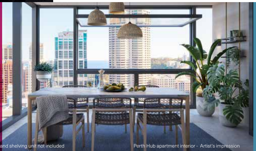
Perth Hub apartment interior - Artist's impression