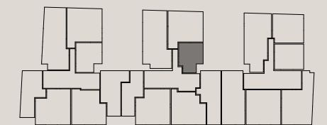
LEVELS 2 & 3

INTERNAL – 50M 2 BALCONY – 8M 2 TOTAL – 58M 2