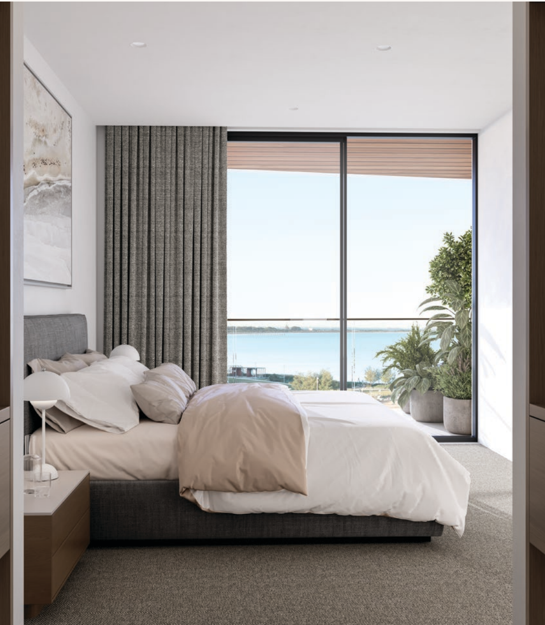
Artists Impressions Only.