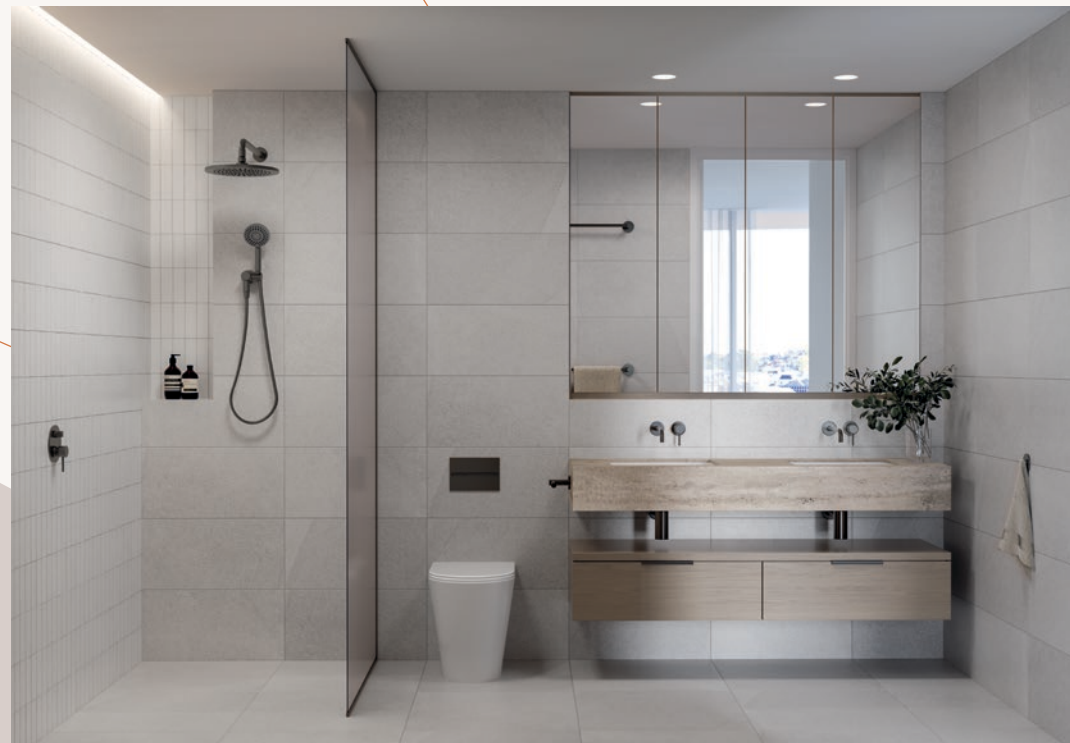
3 Bedroom kitchen & bathroom. Lithic scheme.