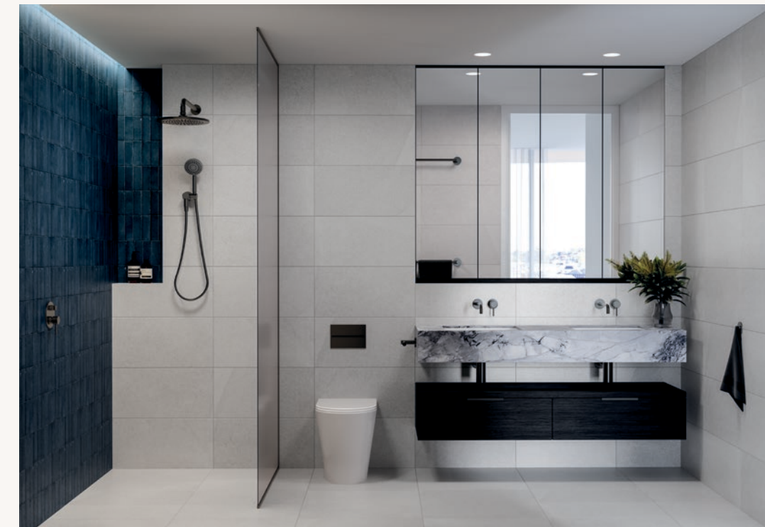
3 Bedroom kitchen & bathroom. Serene scheme.

Life at Windfall offers the perfect balance between luxury living and coastal convenience. With a choice of schemes and finishes available, you'll feel a sense of belonging from the start. Enjoy cooking meals in your fully-appointed kitchen with high quality V-Zug appliances, or retreat to your bathroom to escape the stresses of the day.